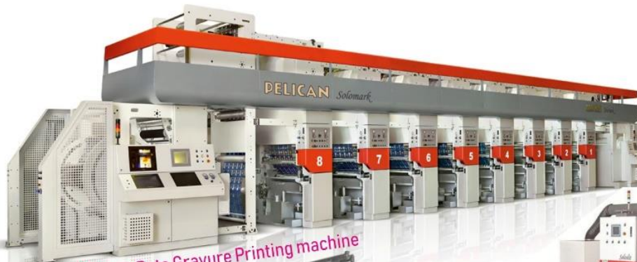
8 Color Pelican Roto Gravure Printing machine