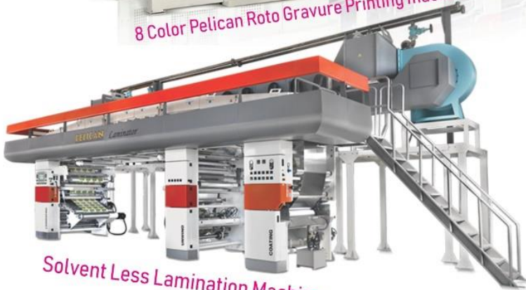
Solvent Less Lamination Machine