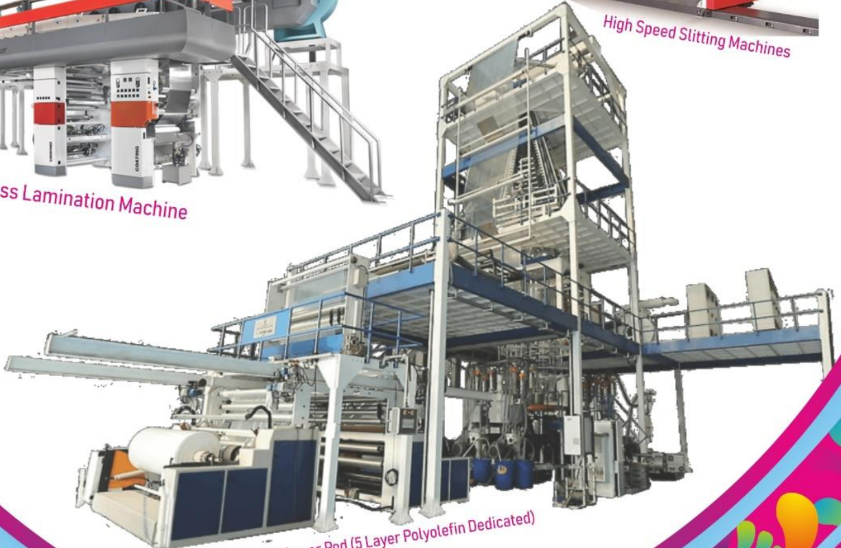
5 Layer Pod (5 Layer Polyolefin Dedicated)