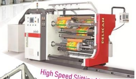
High Speed Slitting Machines